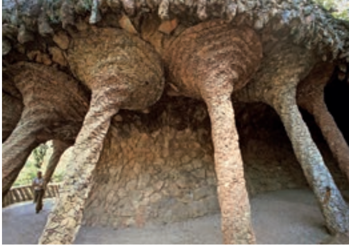
PANORAMIC VIEW OF THE PORTICO LA LAVANDERA PORTICO, SHAPED LIKE A LONG CURLING WAVE; THE SORT PERFECT FOR SURFERS, BUT IN MASONIC IMAGERY SUGGESTING THE FAMOUS BIBLICAL CROSSING OF THE RED SEA

different from the Catholic equivalent, as happens with other stories from the Bible, but Güell and his associates knew how to harmonise them.