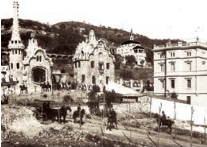
ENTRANCE PAVILIONS TO PARK GÜELL, BETWEEN 1904 AND 1907

to one side and with its architecture and sculpture in the centre of mountainous enclosed land. But, on the other hand, it was intended to be a housing development as well as a park, and thus defies easy definition.