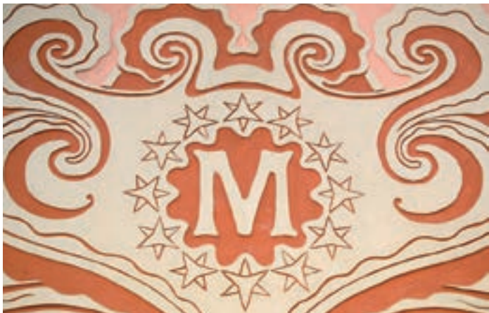
MARIAN DECORATION OF THE VESTIBULE OF THE GAUDÍ MUSEUM