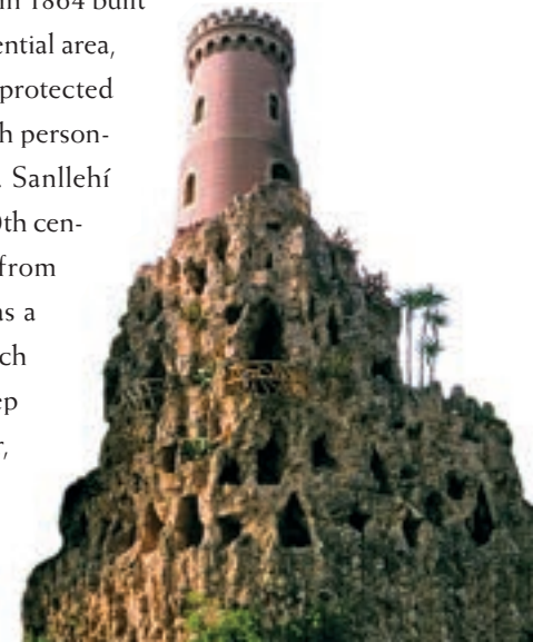
PARC SAMÀ, CAMBRILS