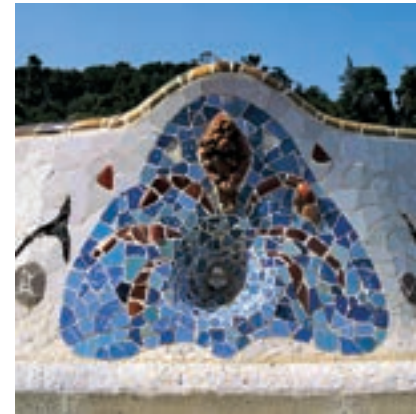
THE SPIDER, A STAGE IN THE METAMORPHOSIS OF CANCER THE CRAB, GAUDÍ'S ASTROLOGICAL SIGN

Notice however that the acroters in the central part of the bench show the palm fronds evolving, transforming through a series of designs into a sort of spider, and then vice versa, becoming a little palm tree again. But the most fascinating thing is that the more one looks at these designs the more one seems to see a metamorphosing crab with powerful claws in different positions – including frontal, with piercing eyes and formidable pincers – and this actually has you doubting wheth-