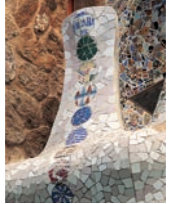
MERLON OF A PAVILION

The walls of the park are decorated with white and red friezes, the colours of the ancient Phoenician navy 2 , indicating in this way that the park is an island or ship, like Thomas More's famous island of Utopia, reached only by sea. The 14 medallions set on the wall, with the words "Park" and "Güell", suggest that this is a park in the English style; on the other hand, the five-pointed star in the P of the word Park is inverted like a horned devil suggesting the